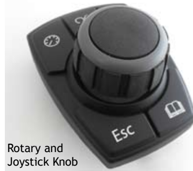
Rotary and Joystick Knob