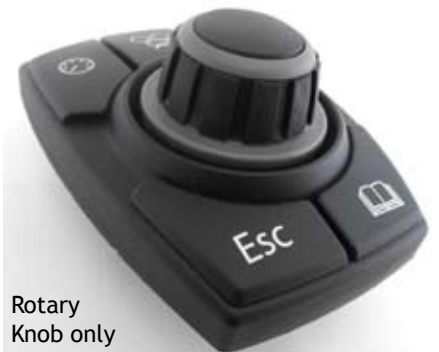
Rotary Knob only